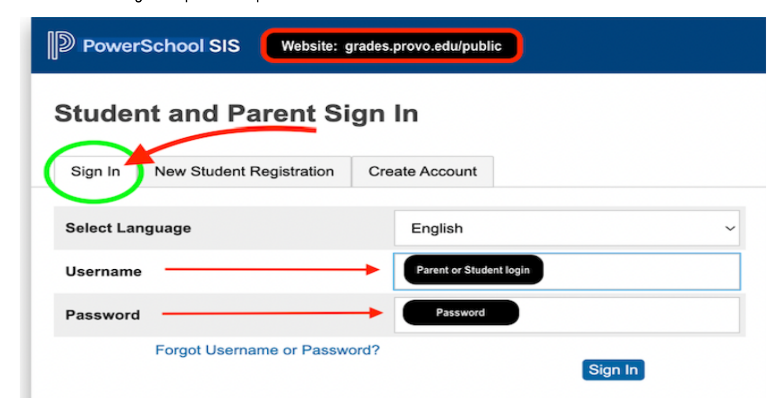
Step 2: Login to your PowerSchool Student or Parent Portal Account