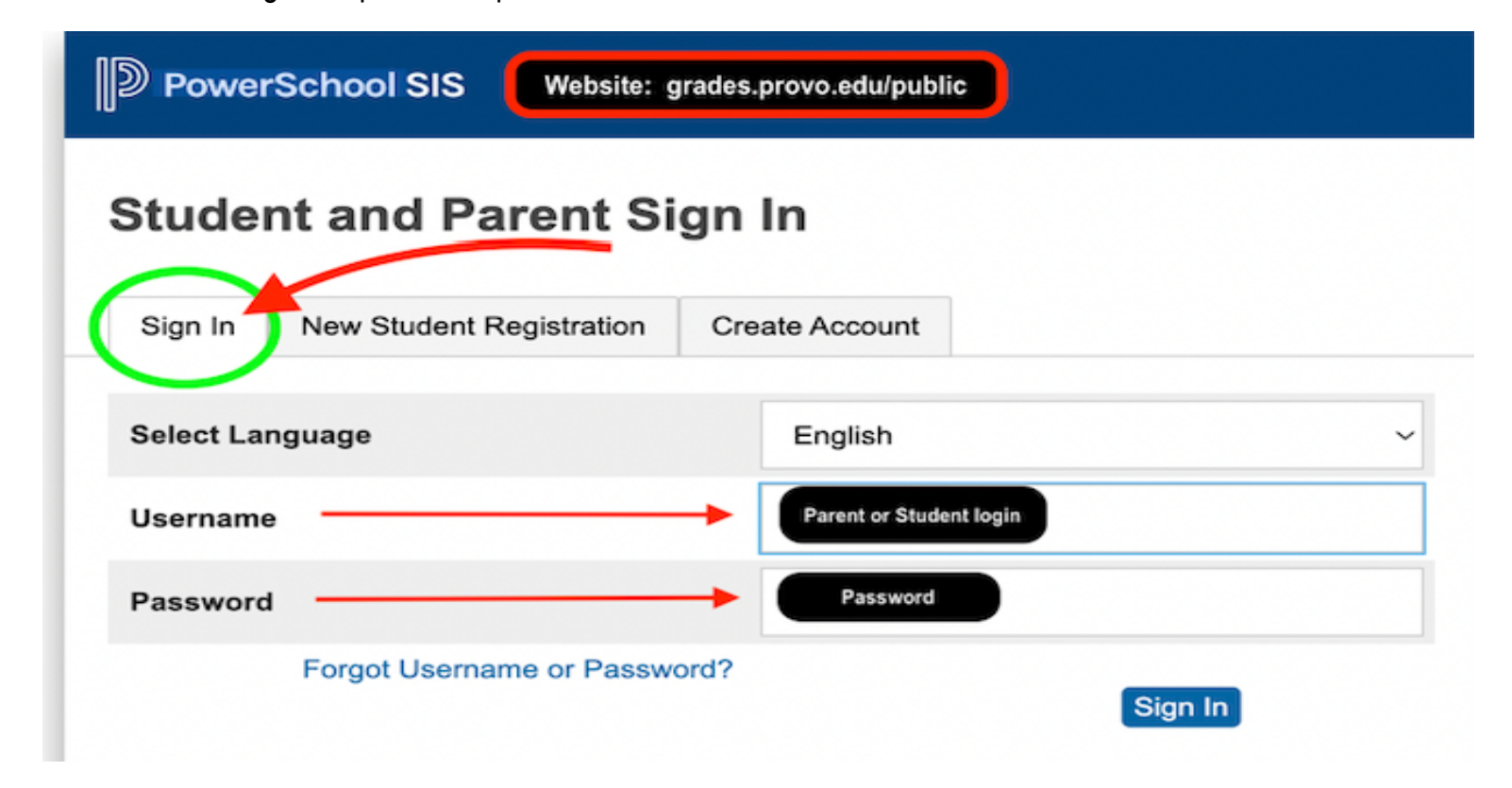
Step 2: Login to your PowerSchool Student or Parent Portal Account